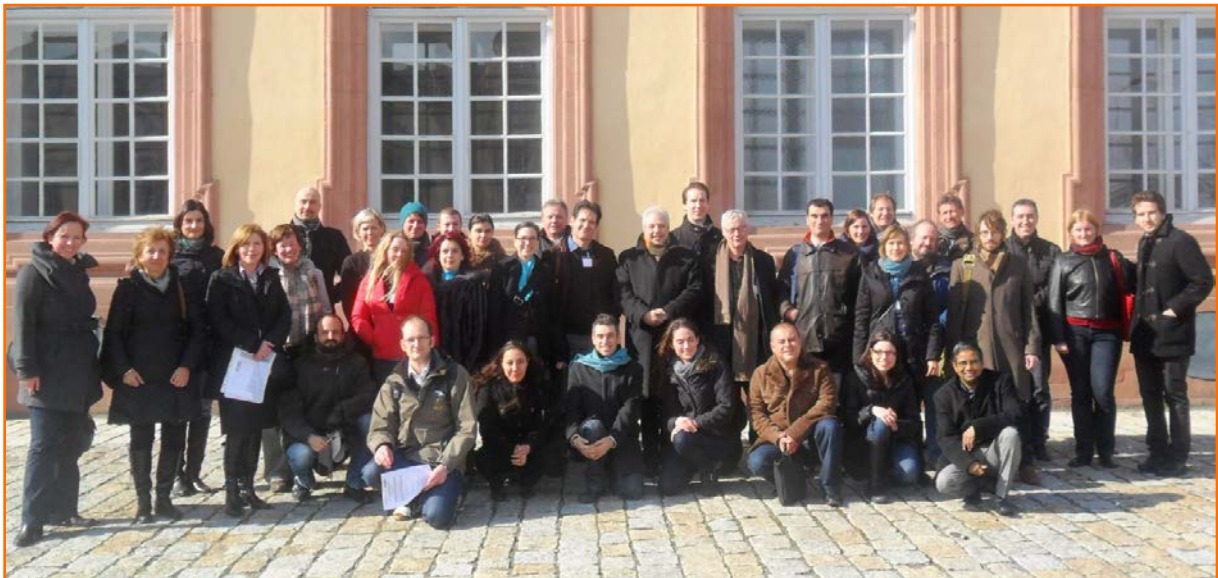
WEBDATANET members who attended a meeting in Mannheim in 2012.

In order to provide web-based data collection with the scientific validity that traditional research methods already enjoy and to tackle remaining methodological challenges WEBDATANET was established in June 2011 as a COST Action and will continue working on these issues through the COST Action until June 2015. It is anticipated that beyond 2015, the interactions of this scientific community will continue in the context of integrated projects and other strategic research initiatives.