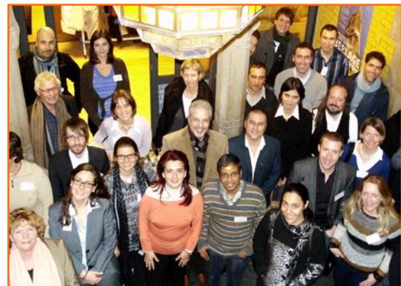
WEBDATANET members who attended a meeting in Amsterdam in 2011.

This task force deals with the changes in empirical social science research and research in other disciplines (e.g. health studies, engineering) due to the extensive use of new forms of web-based data collection. For different fields (e.g. sociology, political science, sociology of technology etc.) the prevalence and importance, particularly, of web surveys as a data collection mode (in comparison to other survey modes or other data collection methods) will be evaluated, and the question will be addressed whether these new forms of data collection methods have changed how social scientists and other disciplines are doing research.