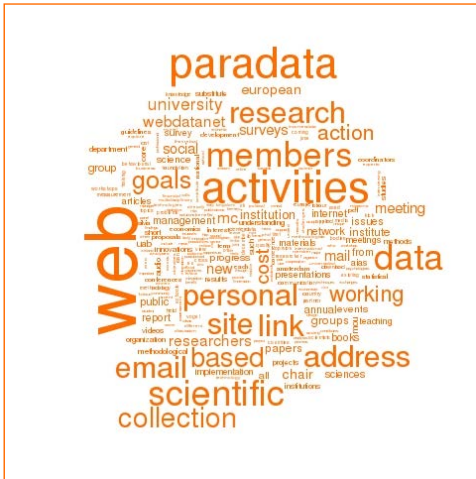
The word cloud is based on content from the network's website at http://webdatanet.eu/

Acknowledgement: The authors would like to acknowledge networking support by the COST Action IS1004.